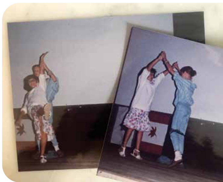
Camp 1 Talent Show circa 1988